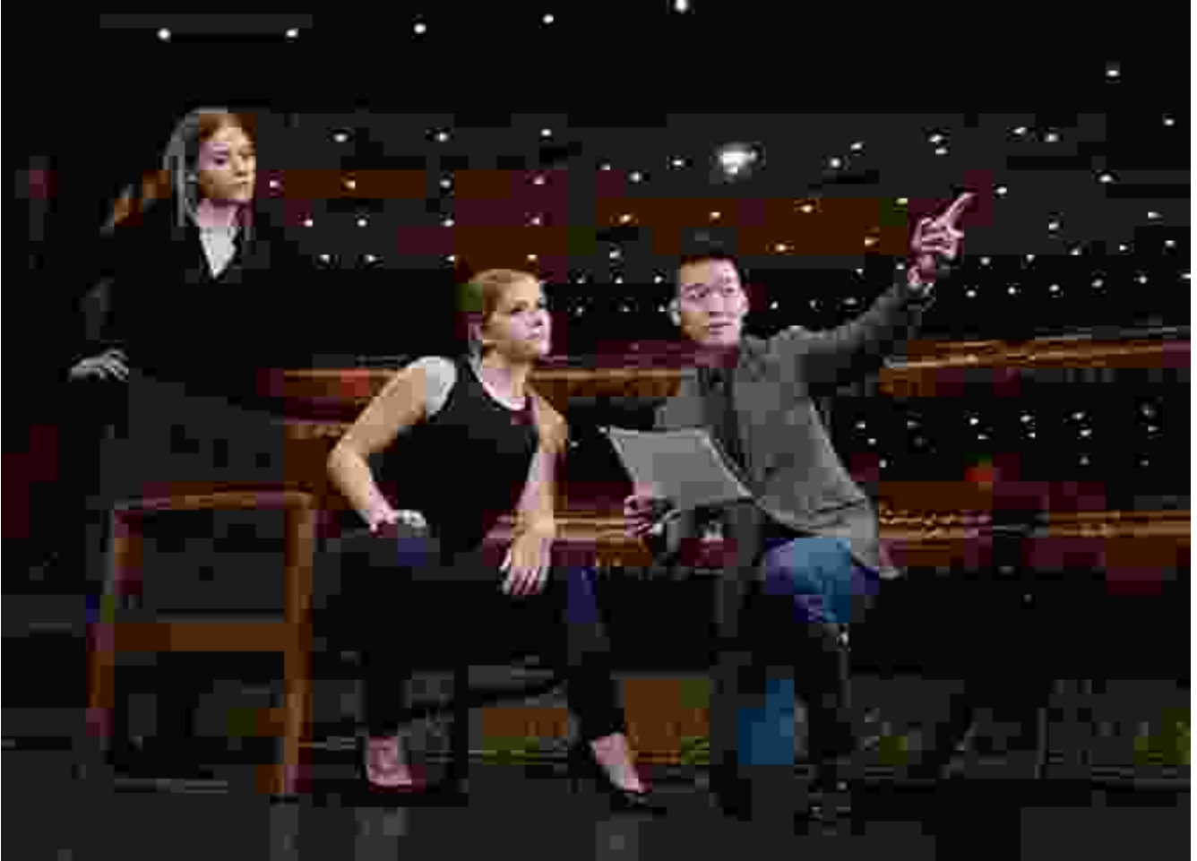
Peter Hall directing a play

Hall was also known for his innovative use of staging and technology. He experimented with different stage configurations, lighting techniques, and sound effects to create immersive and emotionally evocative experiences for the audience.