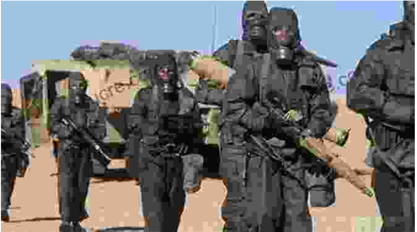
Image 2: A Big Cat crew in training.