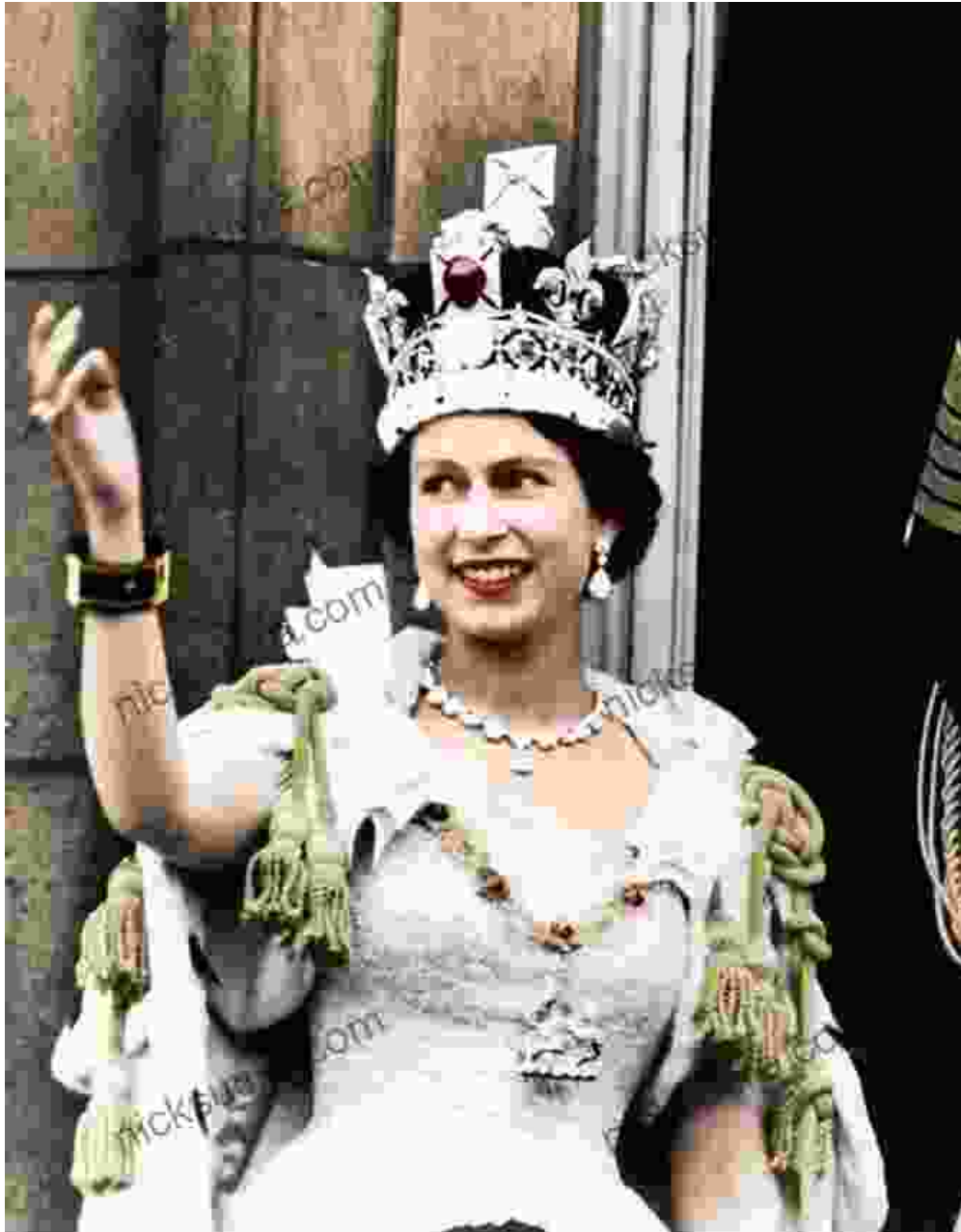
Queen Elizabeth II on her coronation day

Elizabeth was crowned Queen on June 2, 1953, at Westminster Abbey. She was just 27 years old, and her coronation was a lavish affair that was watched by millions around the world.