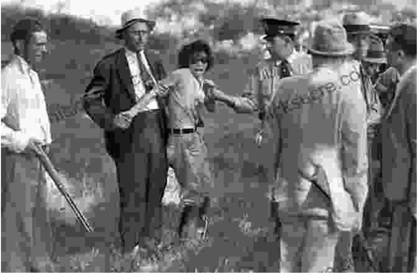
Bonnie and Clyde being arrested