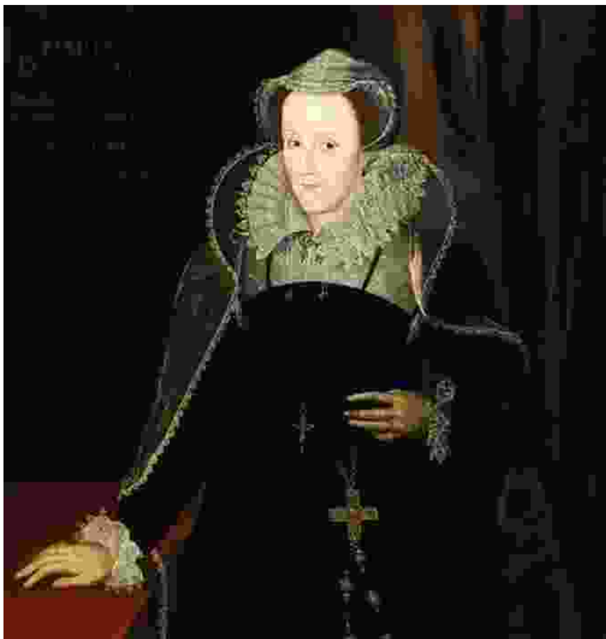
Mary, Queen of Scots