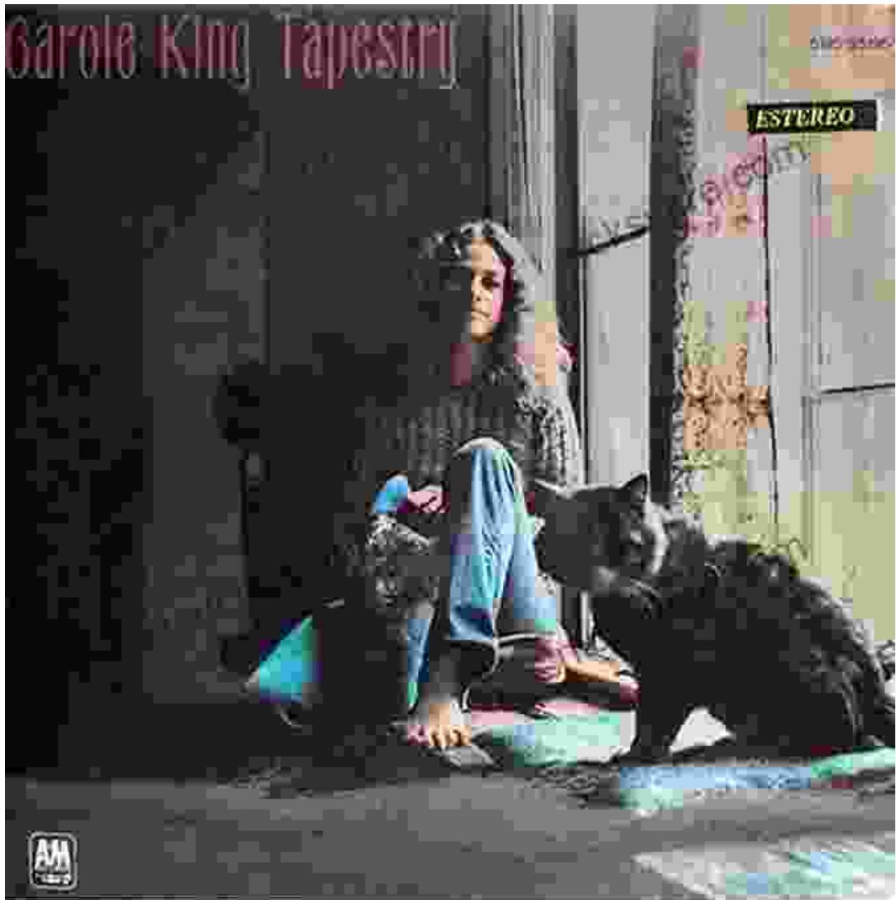
Carole King's iconic album, "Tapestry"

Carole King's "Tapestry" is a timeless classic that showcases her exceptional songwriting and songwriting abilities. The album is filled with instantly recognizable hits, such as "I Feel the Earth Move," "You've Got a Friend," and "So Far Away," which have become enduring anthems of love,