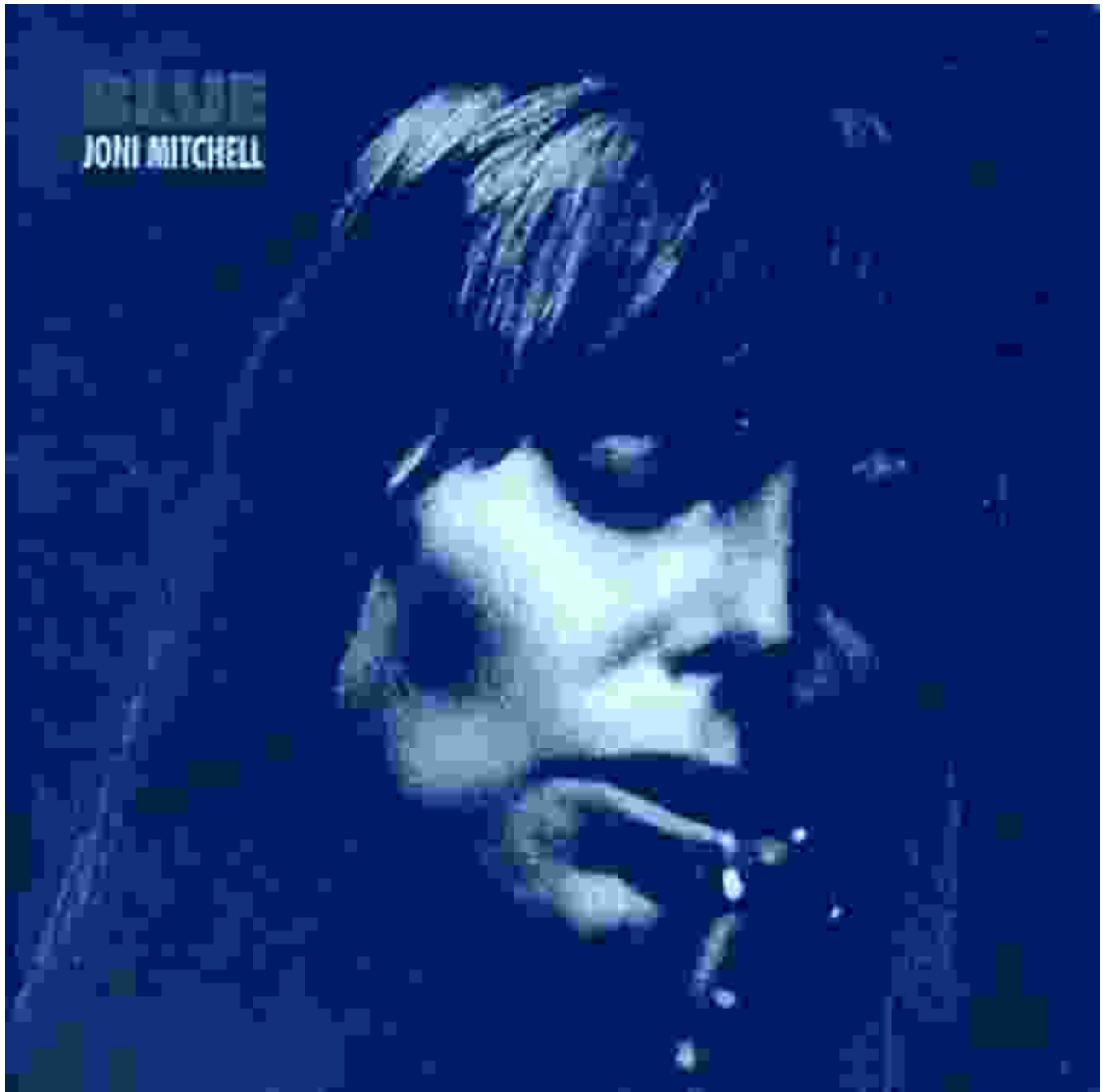
Joni Mitchell's critically acclaimed album, "Blue"