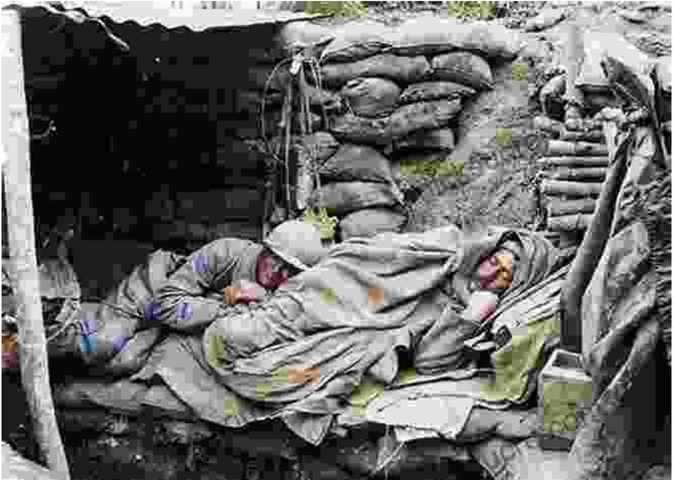
World War I soldiers in the trenches

When the fighting in Egypt drew to a close, Voss was transferred to the Western Front, where he faced a grueling new reality: life in the trenches. The horrors of trench warfare were a stark contrast to the adrenaline-fueled excitement of aerial combat, but Voss bore them with the same stoicism and courage he had displayed in the skies.