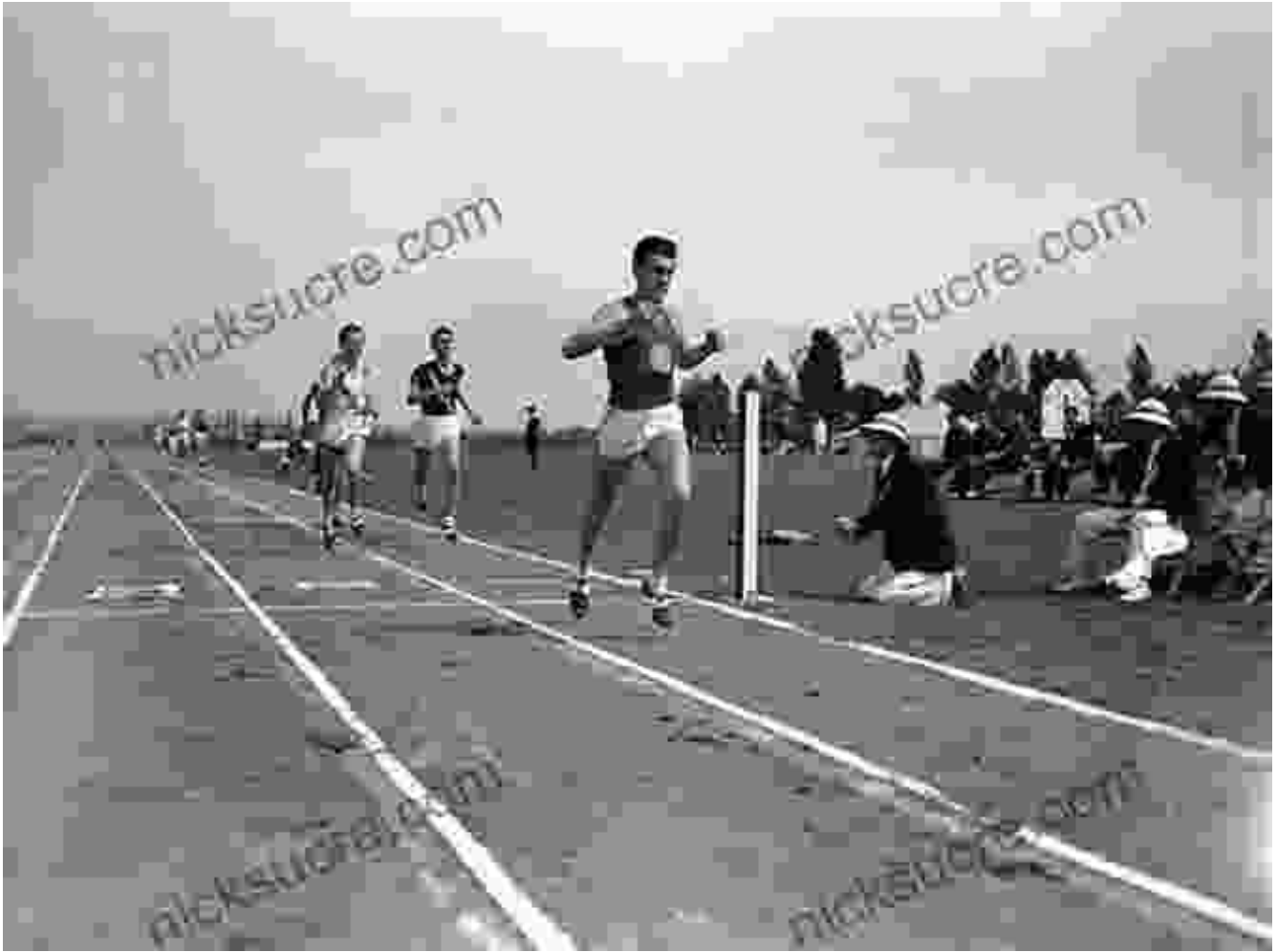
Louis Zamperini competing at the 1948 Olympics