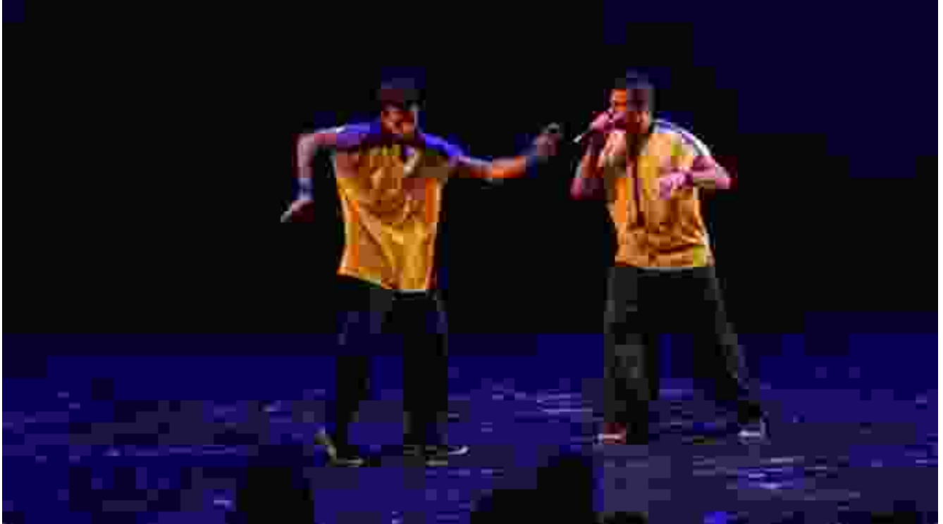
The energy and rhythm of hip hop dance