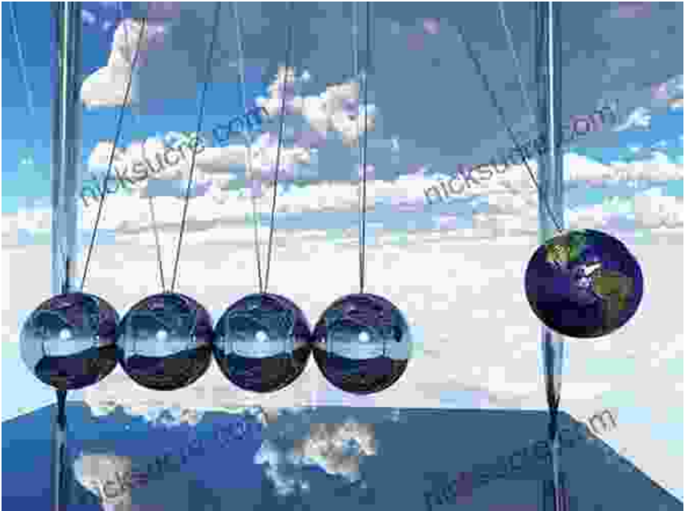
Connie Rubsamen, "Construction in Blue," 1966, Acrylic on Wood and Metal

Rubsamen's exploration of optical effects extended beyond static compositions. She also experimented with kinetic art, which involved utilizing physical movement to create dynamic and interactive experiences for the viewer.