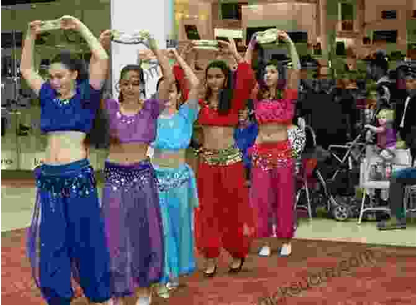
A bellydancer teaches a class.