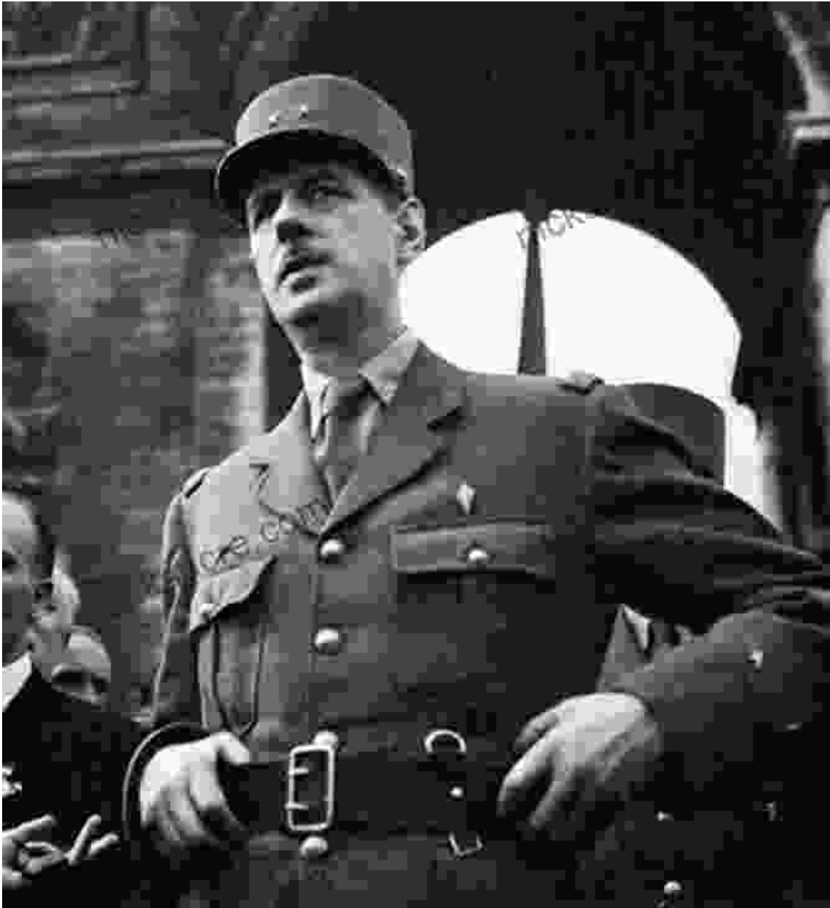
De Gaulle addressing the Free French Forces in London