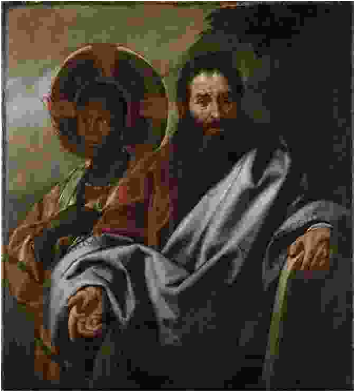
A Journey of Personal Growth and Transformation

Through heartwarming anecdotes and poignant reflections, the memoir celebrates the transformative nature of human interactions. It explores the ways in which these connections provide support, guidance, and a sense of belonging. The author discovers the importance of empathy, compassion, and the shared experiences that unite us all.