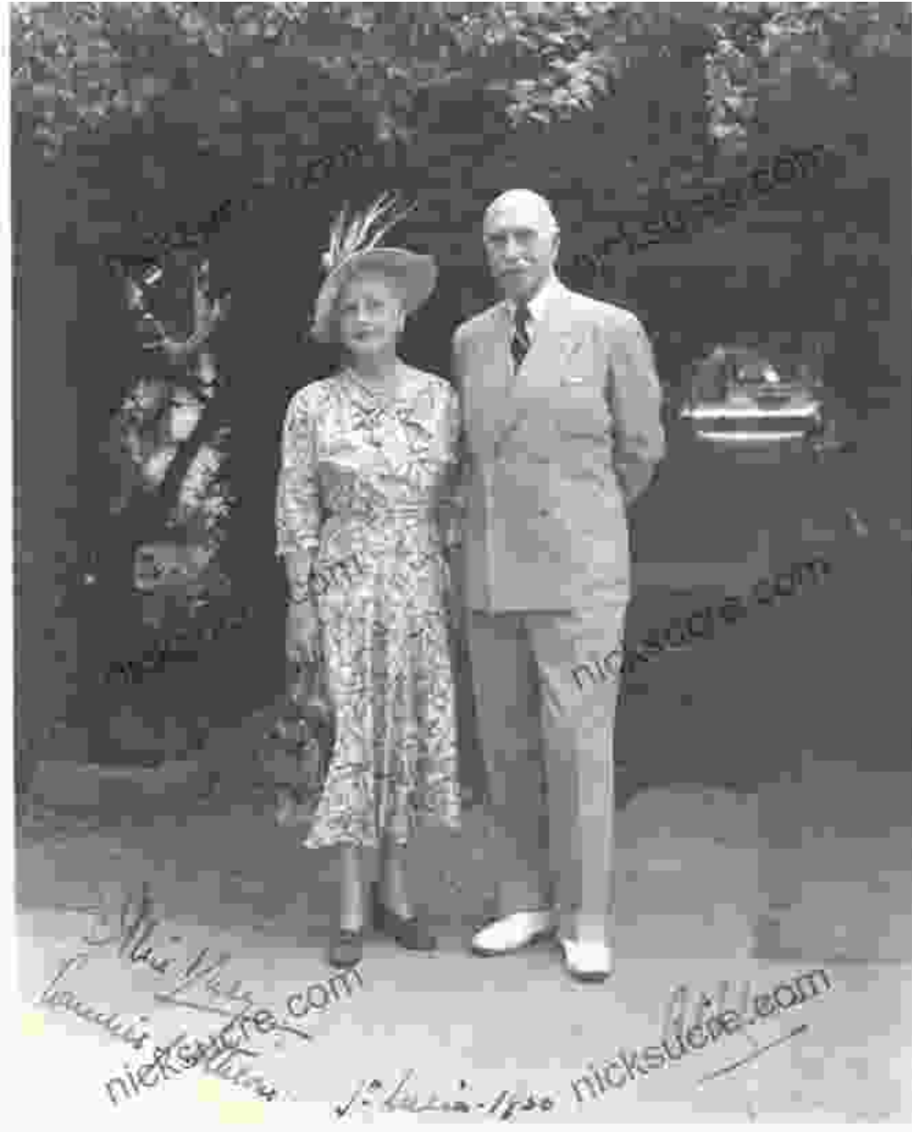
Princess Alice and the Earl of Athlone

Among the most notable guests at Rideau Hall were Princess Alice, Countess of Athlone, and her husband, the Earl of Athlone. Princess Alice was a granddaughter of Queen Victoria and a cousin of King George VI. The Earl of Athlone had served as Governor General of South Africa.