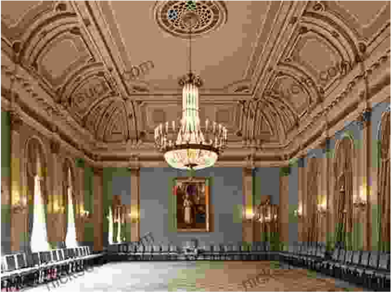
Drawing room at Rideau Hall

While wartime activities were a priority, social life and cultural exchange also played an important role at Rideau Hall. The British aristocrats and Canadian hosts shared ideas, experiences, and traditions.