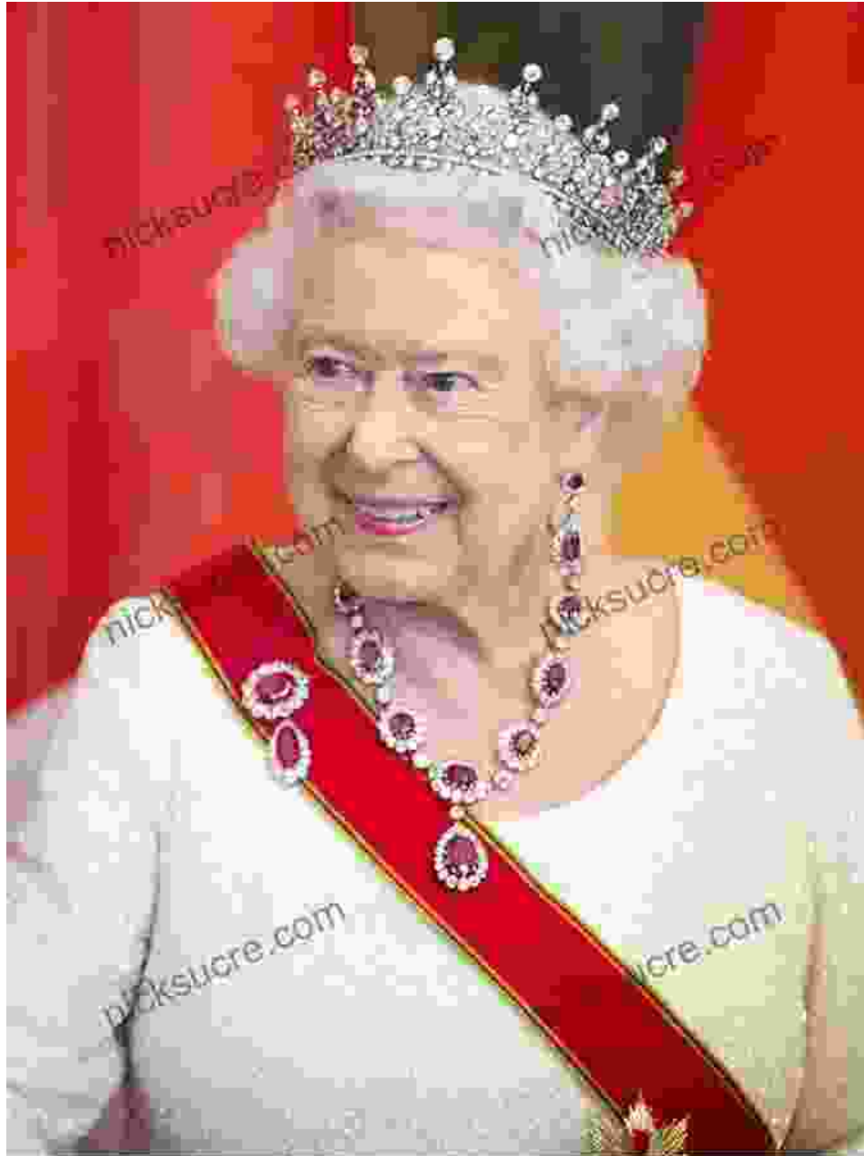
Queen Elizabeth II in 2015